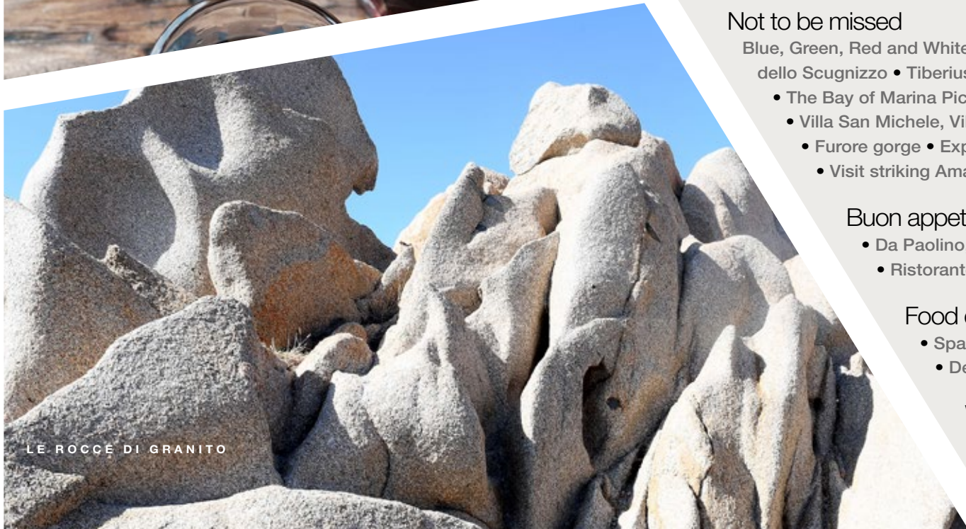
LE ROCCE DI GRANITO