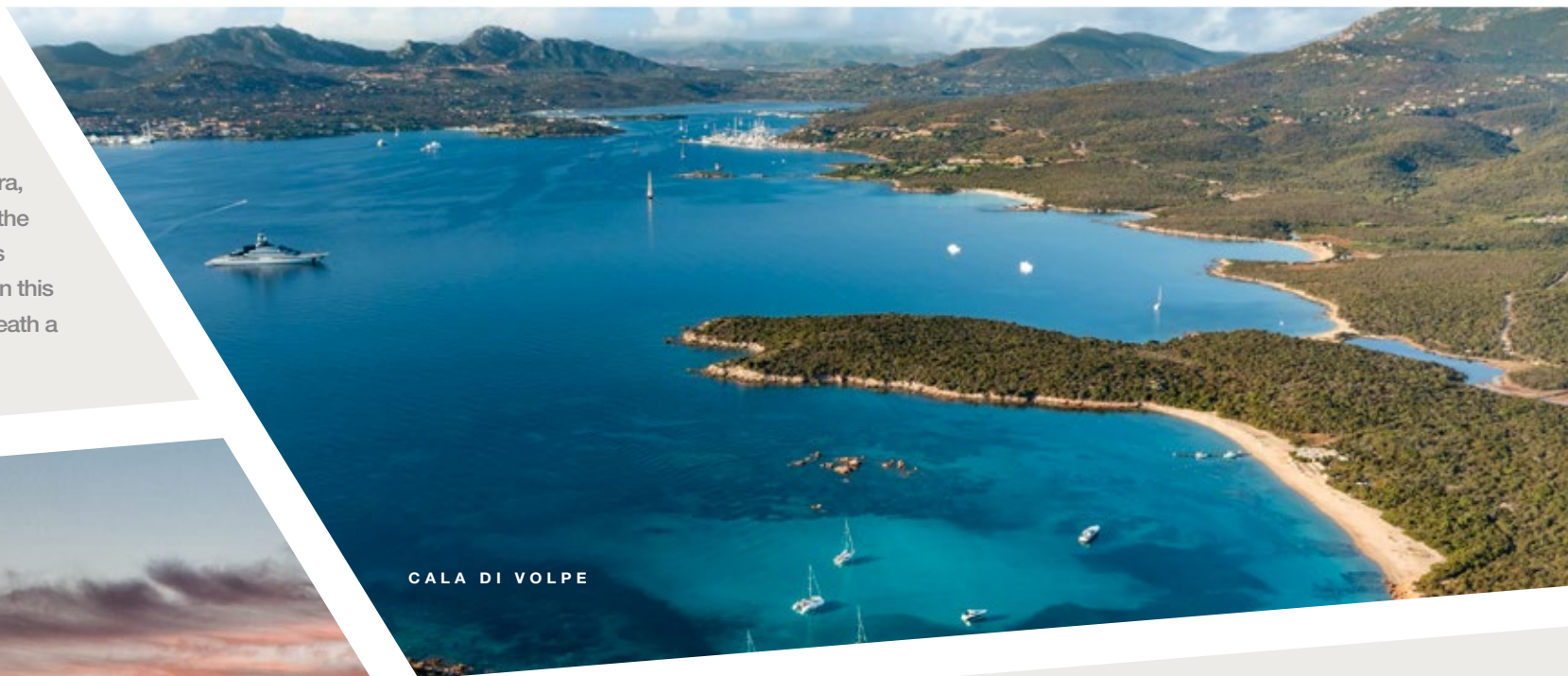
CALA DI VOLPE

Enjoy the breathtaking silhouette of Tavolara, a majestic island rising like a fortress from the sea. Swim in its emerald waters, explore its natural sanctuary, and let time slow down in this extraordinary setting. Spend the night beneath a star-filled sky at Tavolara.