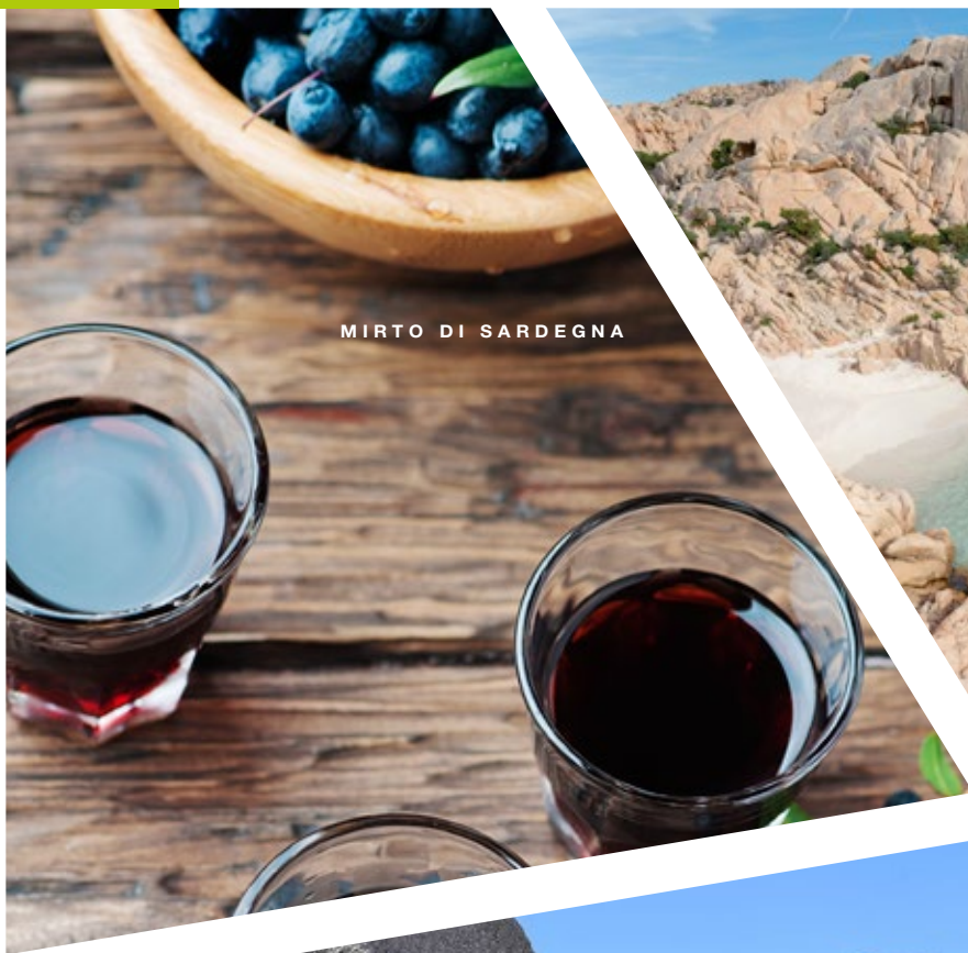
MIRTO DI SARDEGNA