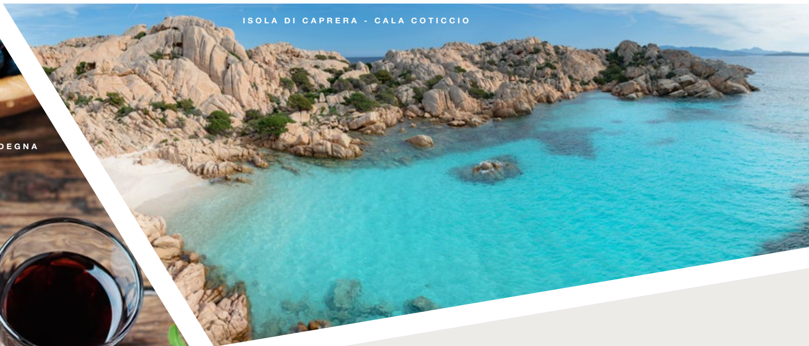
ISOLA DI CAPRERA - CALA COTICCIO