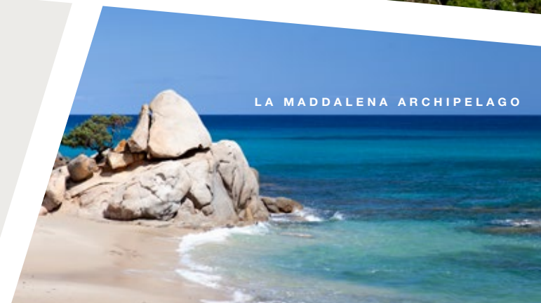
LA MADDALENA ARCHIPELAGO

The evening is spent anchored at La Maddalena, where the magic of the islands lingers in the air.